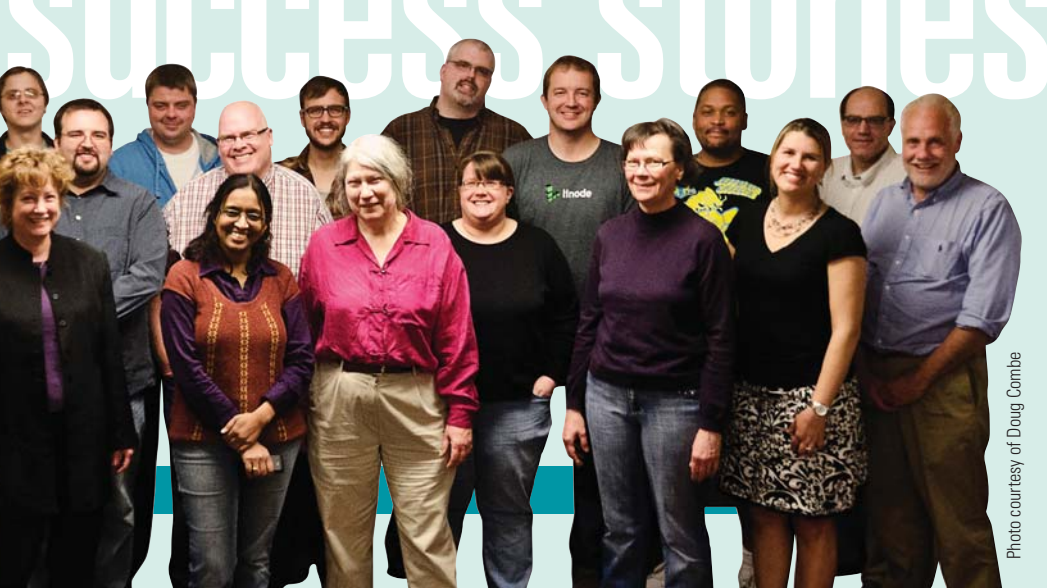
Inaugural Shifting Code graduation class